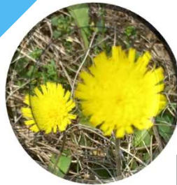
Mouse-Ear-Hawkweed ( Pilosella officinarum )