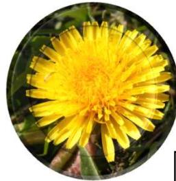
Rough Hawkbit ( Leontodon hispidus )