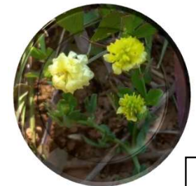
Black Medick ( Medicago lupulina )