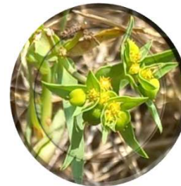
Dwarf Spurge ( Euphorbia exigua )