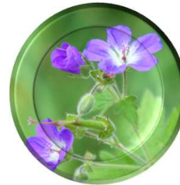
Soft Cranesbill ( Geranium potentilloides )