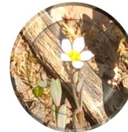
Fairy Flax ( Linum catharticum )