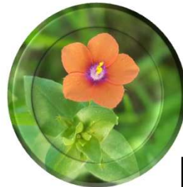
Scarlet Pimpernel ( Anagallis arvensis )