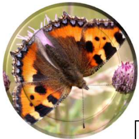
Small Tortoise Shell (Aglais urticae)