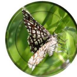
Latticed Heath Moth (Chiasmia clathrate)