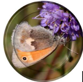
Small Heath (Coenonympha pamphilus)