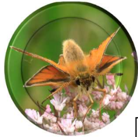
Essex Skipper (Thymelicus lineola)