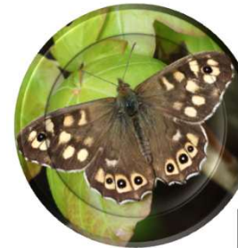
Speckled Wood (Pararge aegeria)