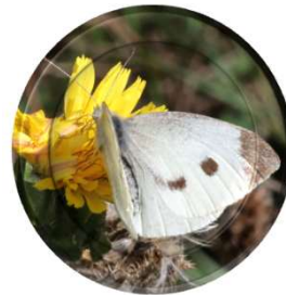
Small White (Pieris rapae)