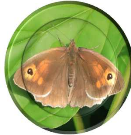
Meadow Brown (Maniola jurtina)